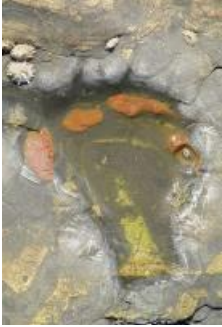
Tidepool #1 © Ken Timm Seaweed © Ken Timm