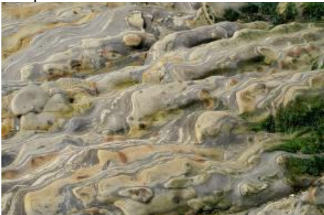
[3] Weston Beach Rocks

If you go be aware that the number of vehicles and hours are limited and there is an entrance fee (unless you hike in). It is a long way from Sequim, but highly rewarding, and there's also Monterey, Carmel, Pacific Grove and Big Sur nearby!