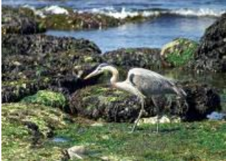
[2] Heron

My favorite spot is Weston Beach where one can discover endless abstracts: