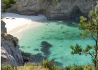
[1] China Cove

In 1946 Edward Weston (1886-1958) accepted an offer from Eastman Kodak to make color photographs of Point Lobos State Reserve (CA). He lived nearby in Carmel Highlands so he knew the area well. (Incidentally, he often sold his photos for $7 - $15, but Sotheby's recently sold one of his prints for $1.6 million!) Those photos were among the last he made when he stopped in 1948 due to Parkinson's. The preserve, 3 miles south of Carmel, CA http://pt-lobos.parks.state.ca.us/trails.htm is one of the most beautiful meetings of land and sea on earth. It seems to have it all: jagged rocks with crashing waves, wave tunnels, flowers, meadows, wind-blown cypress trees, lichens, hidden coves, an old whaler's cabin, SCUBA diving to undersea worlds amid giant kelp forests, a white sand beach with clear turquoise water [1], seaweeds and shellfish, herons [2], gulls, pelicans, monarchs, sea lions and sea otters, and unusual rock formations [3]